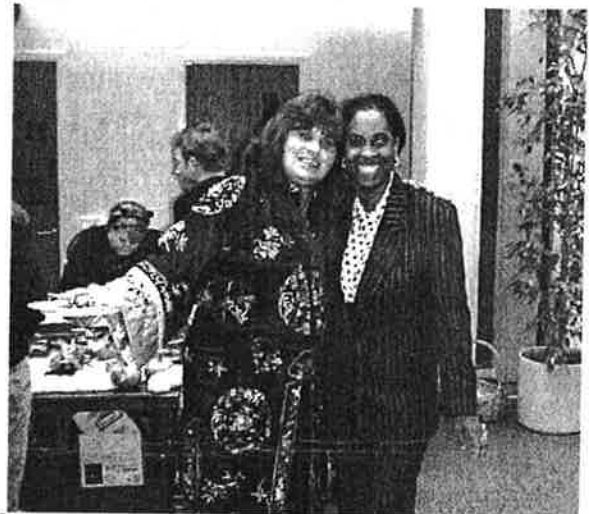
♫ Friendship, Friendship, nothing like Friendship ♫