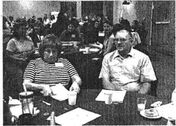
Wonder when they'll serve lunch?