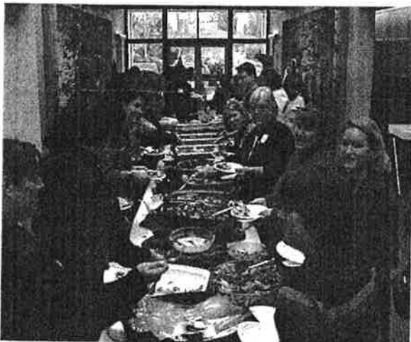
OH GOOD!! F O O D (at last!)