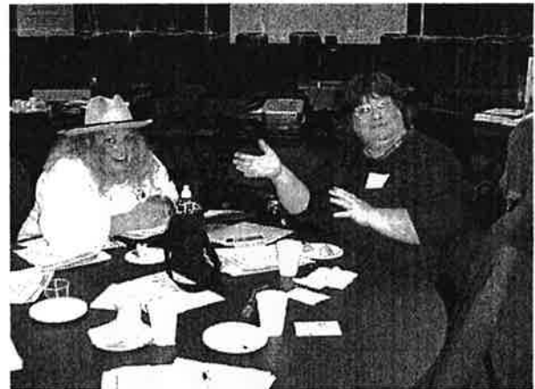
.....That's ALL Folks!! .....