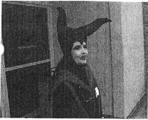
Where is that Snow White? It's time to she ate the apple!