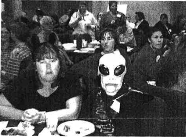
(Who was that masked ... alien??)