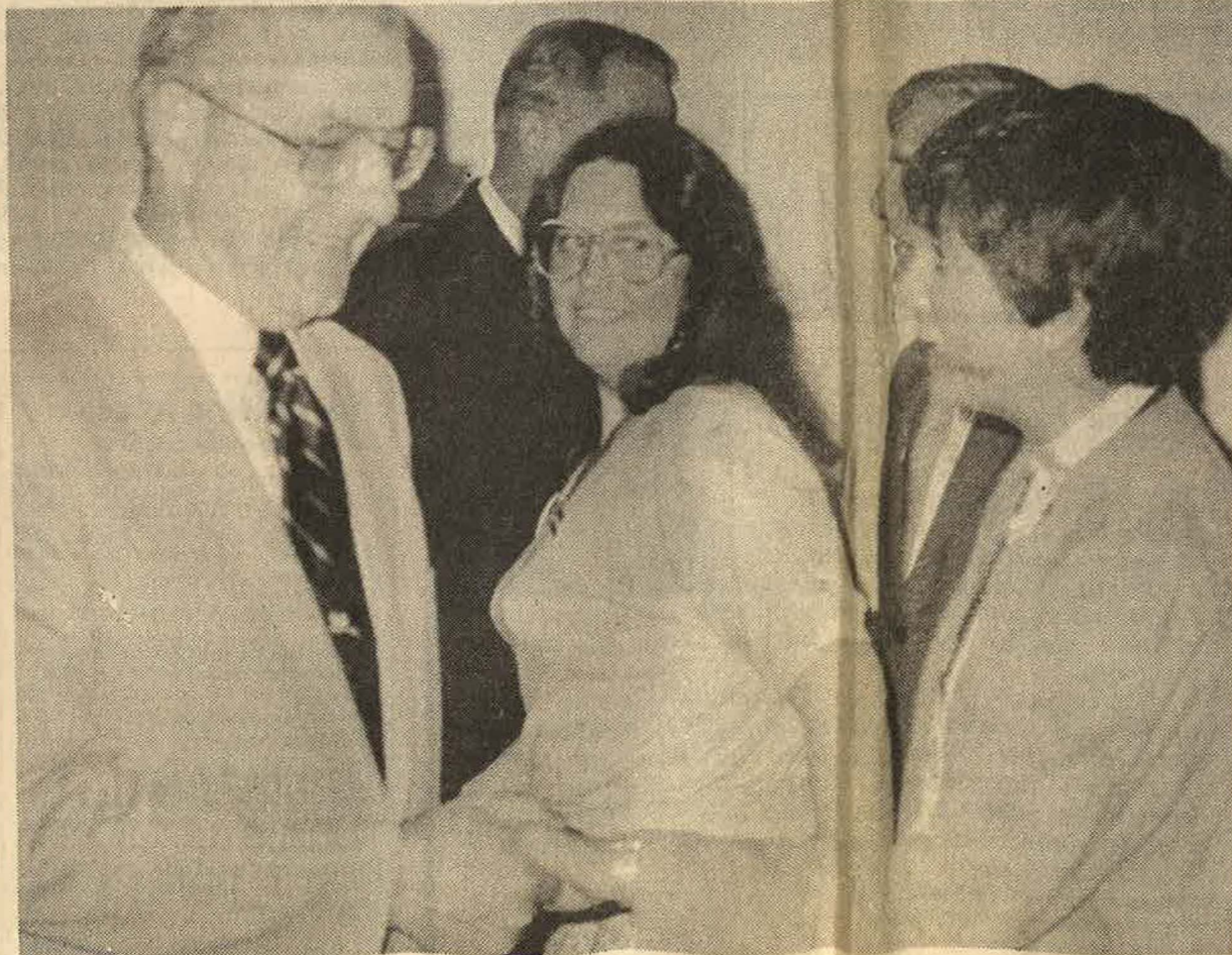
Governor Atiyeh greets Ma Anand Sheela