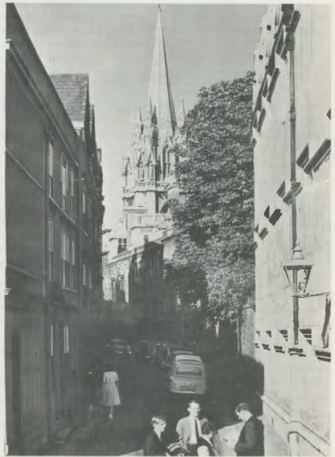
OXFORD Oriel Street towards St. Mary's Church.