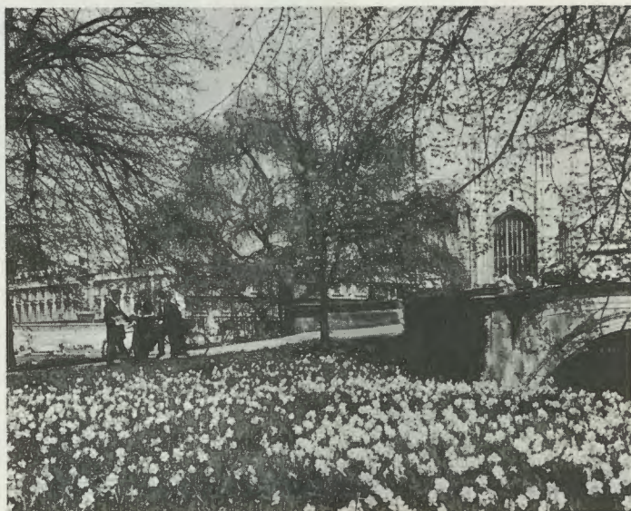
"The Backs," Cambridge University.

FRIDAY, AUGUST 9 – COPENHAGEN – HARWICH. After wonderful days in Copenhagen, motor through the fertile countryside past lovely villages across Sealand to the port of Halskov to board the ferry to the Funen Island; then proceed to Hans Christian Andersen's home town of Odense: visit his home and museum and continue direct to Esbjerg over the Little Belt bridge to Jutland and via medieval Kolding in time to board steamer sailing to Britain.