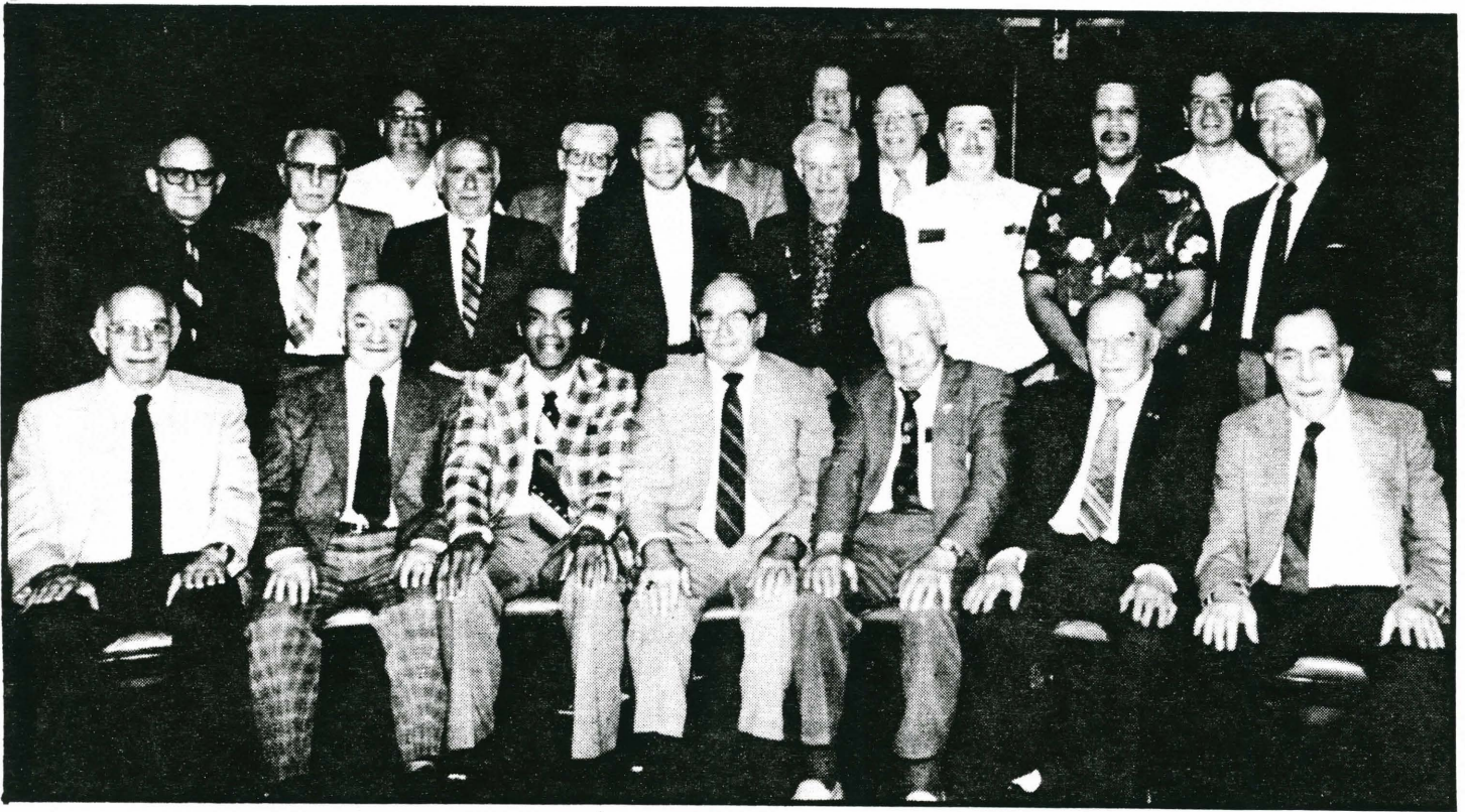
1987 - 88 BOARD MEMBERS