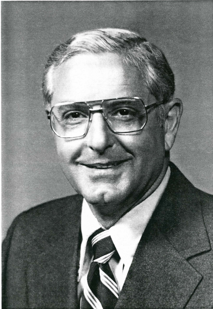
GOVERNOR VICTOR ATIYEH

EX-NEWSBOYS 78th ANNUAL BANQUET THURSDAY - MAY 14, 1998