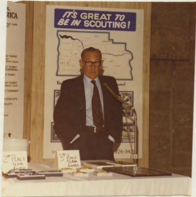
Seventh Annual Scouting Trust Fund Golf Tournament and The Council Trust Program Provides for "THIS GENERATION AND FUTURE GENERATIONS OF SCOUTS"