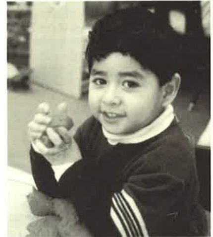
A Head Start student hard at play. Head Start is CAO's longest running program.