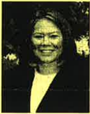
New CCAP recipient