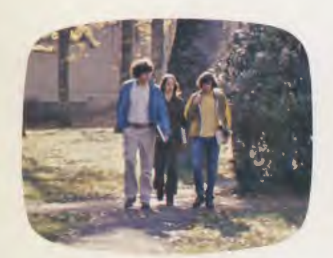
"a successful professional school"