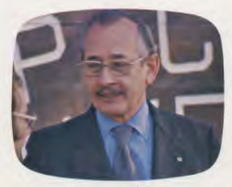
"and capable leadership"