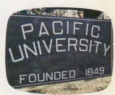
"mark 124 years of progress."