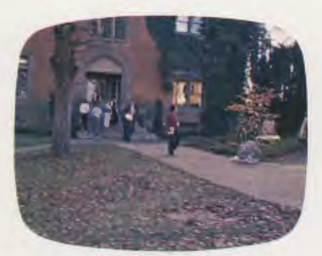
"was marked by few buildings,"