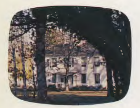
"The beginning of Pacific . . ."

These photographs were taken from a film shot this fall on Pacific University's campus. The film is part of a program developed to encourage enrollment growth and increased financial support.