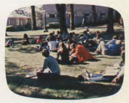
"and small classes."