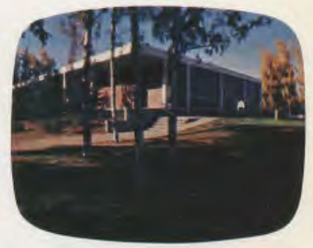
"a larger more diverse student body,"