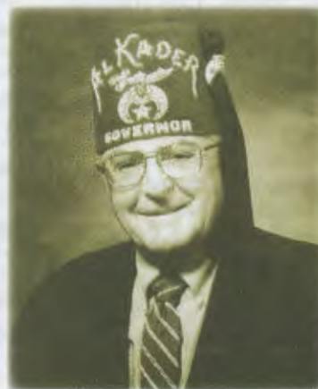
Noble Victor G. Atiyeh Governor of Oregon 1979-1987