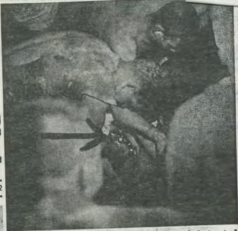
2 Above is pictured a tangle of arms, legs, and heads (most of them still miraculously attached to torsos) of students fighting for Boxer (arrow). ...they (the cou...