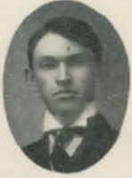
WILLARD H. WIRTZ