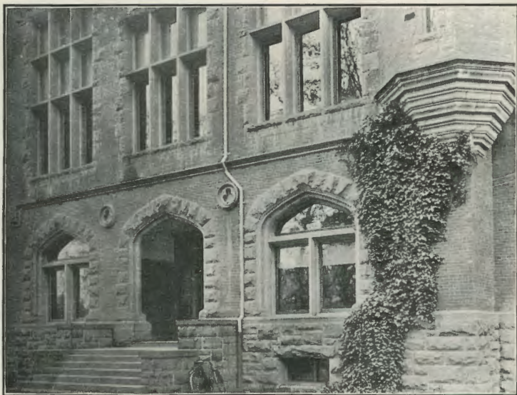
ENTRANCE TO MARSH HALL.

T his Booklet is the work of Alumni and Students of Pacific University with the approval of the president. ¶ Its main object is that it may serve as an aid to those who are about to choose a college in which to pursue their studies.