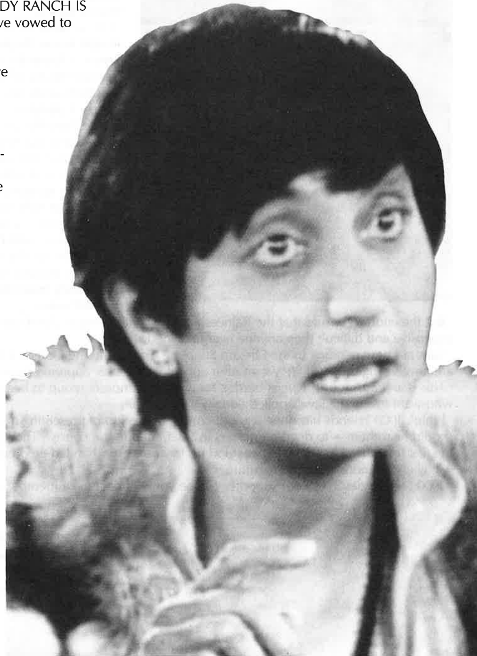
Ma Anand Sheela